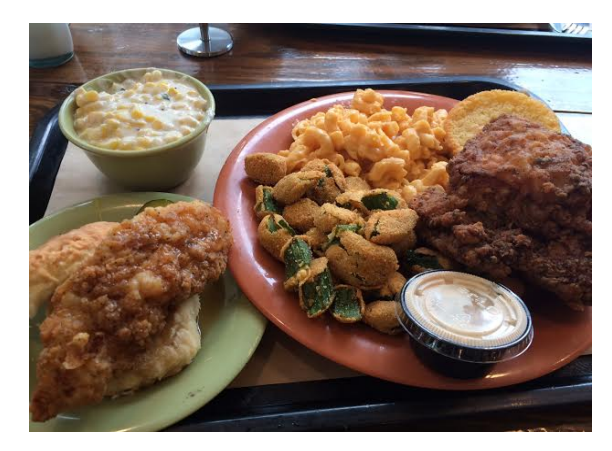
Fried chicken with skillet cornbread, mac n' cheese, fried okra, creamed corn, and chicken n' biscuits with a maple drizzle.

The Coop is a delightful southern restaurant located in Winter Park on the corner of Morse Blvd. and Pennsylvania Ave. With a focus on freshly fried chicken, they also serve delicious "fixins" (side dishes) such as crispy fried-okra, skillet cornbread, silky creamed corn, and many more. With its simple rustic interior design, this restaurant has a pleasant and relaxing feel to it as well. If you're looking for a quaint place to eat on the weekend with friends or family, this place is definitely worth stopping by.