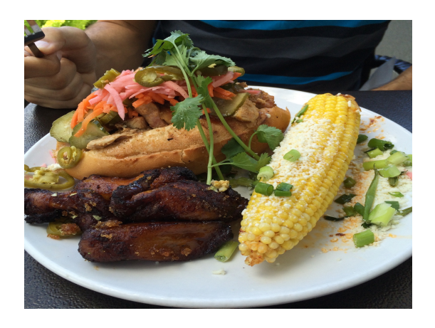
"Barbakoa Banh Mi" Oakwood smoked pulled-pork, lucky dragon sauce (so sweet yet savory!), ginger-garlic aioli, pickled vegetables, jalapeños, and cilantro on a toasted sub roll, corn, and fried plantains.

Out of all the local restaurants on Mills Ave., Pig Floyd's Urban Barbakoa is a real local treasure. This place is easy to miss and pass by with only a silhouette of a pig with flames marking its location. Ranging from braised brisket to Oakwood smoked pulled-pork to grilled pork belly, Pig Floyds has a plethora of options for the hungry individual seeking a fulfilling meal. If you stop by in the morning, you can already smell the meats being freshly cooked for the day. If you stop by too late in the evening, I guarantee you that not all the menu options will be available anymore, especially the braised brisket.